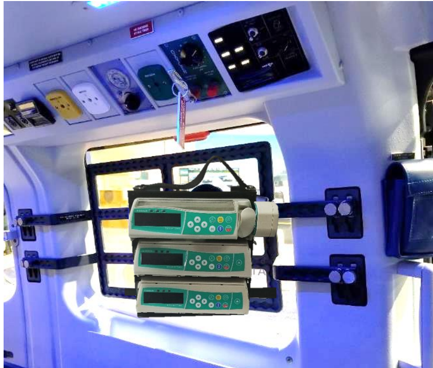
IP10-9 without CME Infusion Pump Installed

IP10-9 installed on FAA Approved EMS Medical Wall